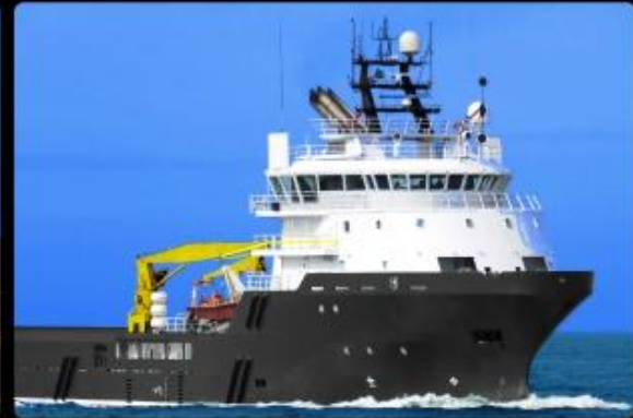
FOR MARINE VESSELS