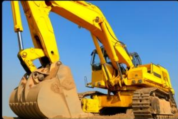
FOR MOBILE WORK MACHINES